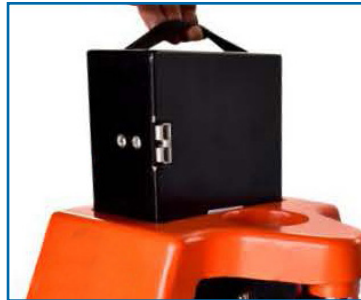
Easy to remove Lithium battery