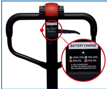
Battery Life Indicator