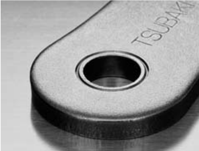
Fig. 13 Ring Coined Connecting Link Plate

Transmission capacity has been increased by applying the patented TSUBAKI Ring Coining process on the connecting link plate.