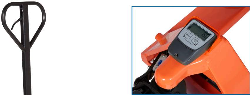
WPT57H Weigh Scale Display