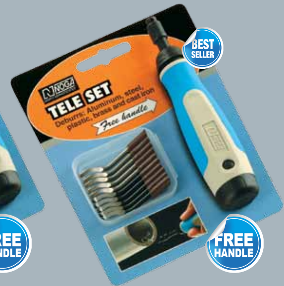
Tele Set NG8350 INCLUDES: NogaGrip-3- handle - NG3000 S Holder EL02003 5 pcs. S10 blades - BS1010 5 pcs. S20 blades - BS2010