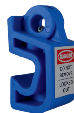
Universal MCB LOK141