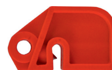
Fuse Lockout LOK140

SPARTEX, exclusively available from Rubix, Europe's largest supplier of industrial products. All your essentials covered with guaranteed availability for any European site, at a quality that gets the job done. With branches nationwide we're just down the road.