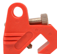
Universal MCB LOK043

Contact us for more Lockout Tagout products.