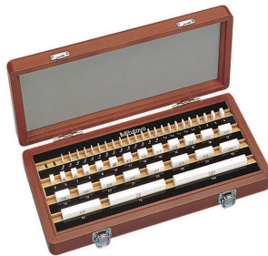
CERA 47-block set