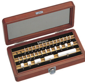
CERA 32-block set

Mitutoyo provides a wide selection of boxed sets of gauge blocks to meet the various needs of industry. Selecting the best set, or sets, to acquire usually depends on the accuracy required by the target applications, the level of convenience desired and the environmental conditions in which they will be used.