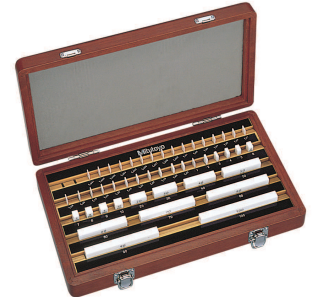
CERA 46-block set