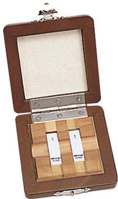
Ceramic 2-block set