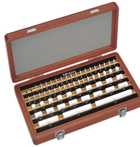
CERA 56-block set