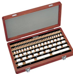
CERA 103-block set