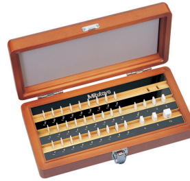
CERA 34-block set