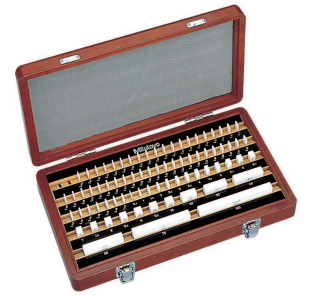
CERA 76-block set