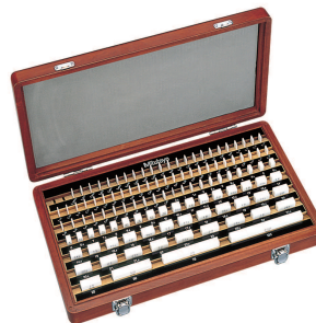
CERA 112-block set