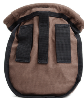
Belt loops located on back of pouch.