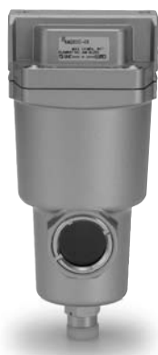
AMG150C to 550C

Modular connection is possible with AMG150C to 550C. (For details, refer to page 61.)