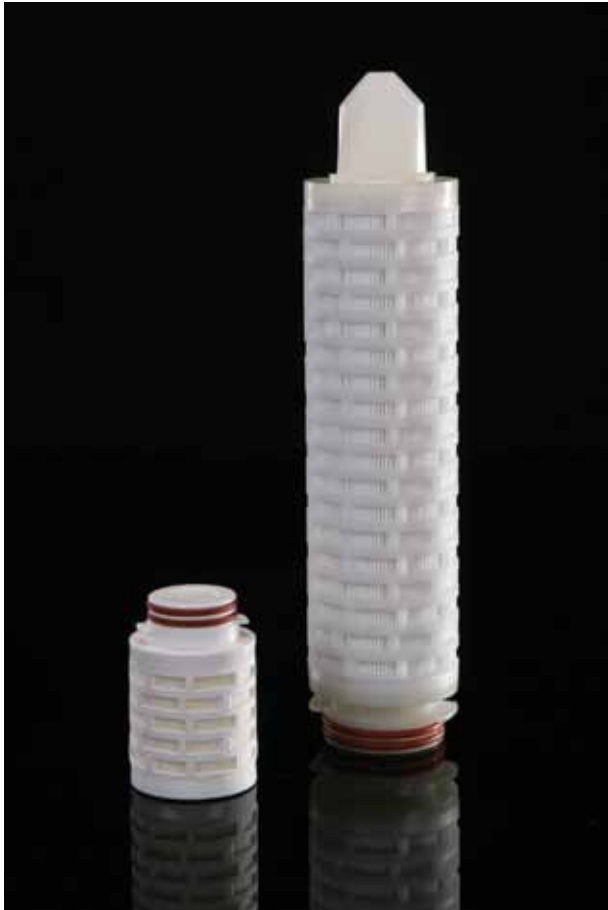
Note: BIO-X is a registered trademark of Parker domnick hunter