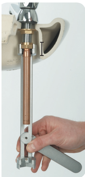
Sliding jaws locked in position to allow tightening / removal of pipe nut.