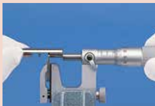
Using flat anvil (201216)