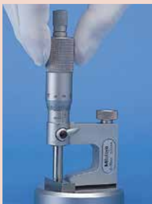
With the disc. anvil (950758) Shown above, the Uni-Mike is used as a height micrometer.