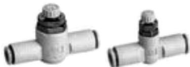
Applicable tubing O.D. ø2