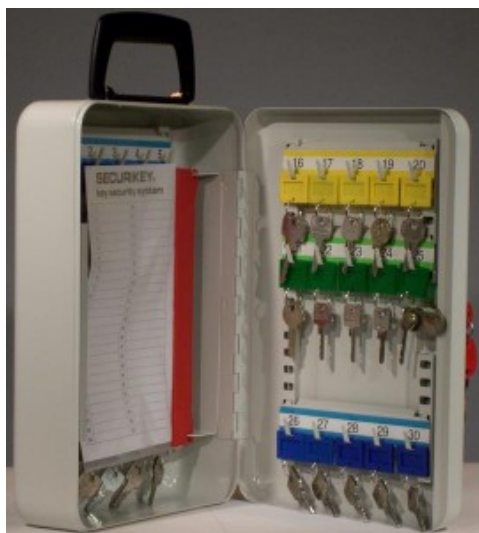
System 30 Portable