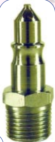
100 Series Adaptors