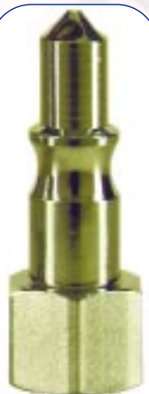
60 Series Adaptors