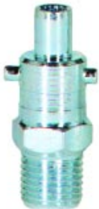
Instant - Air Adaptors