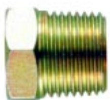
Reducing Bush m/f