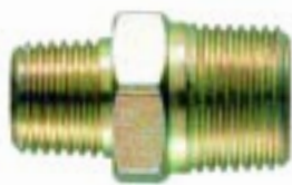
Reducing Union m/m