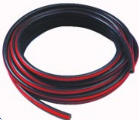
Rubber alloy air hose