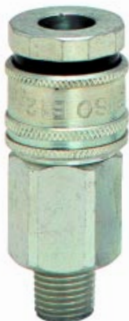
ISO B12 Couplings