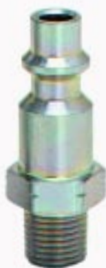
ISO B12 Adaptors