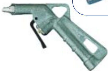
Pistol Grip Blowguns