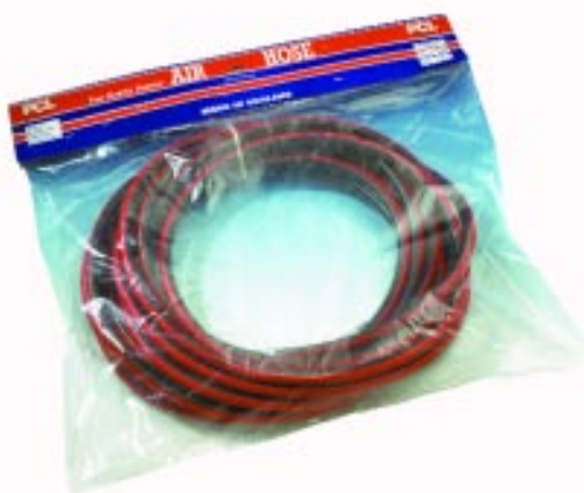
Pre-packed air hose

1=A, 5=B, 10=C, 15=D, 20=E, 25=F, 30=H, 35=J, 40=K, 45=L, 50=M, 55=N, 60=P, 65=Q, 70=R, 75=S, 80=T, 85=U, 90=V, 95=W, 100=X.