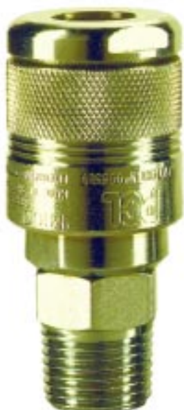
100 Series Couplings