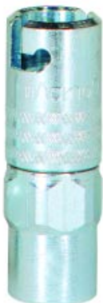
Instant - Air Coupling