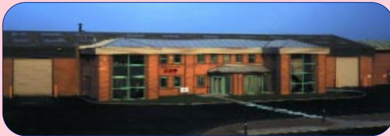
PCL HQ Sheffield, England