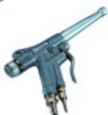
Air and Water Gun