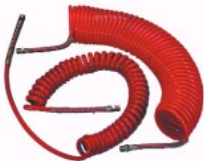
Coiled Hose Assemblies