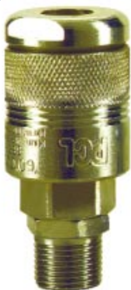
60 Series Couplings