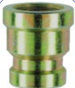
Reducing Bush f/f