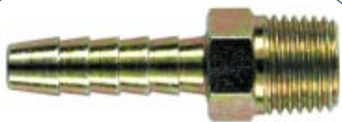
Male Screwed Tailpiece