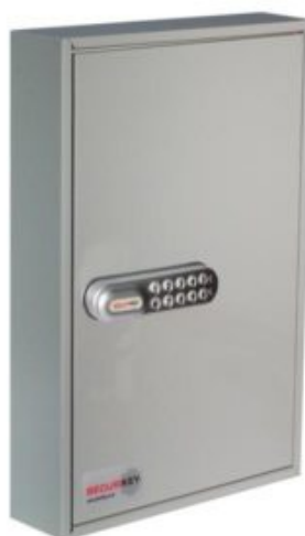
System 64 CL1000 Electronic Cam Lock