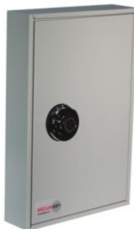
System 64 Dial Combination Lock