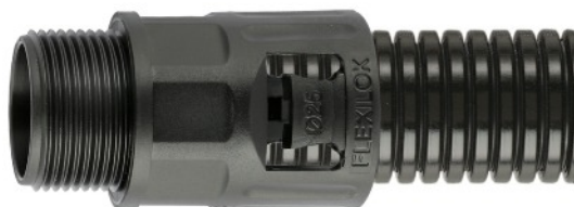
FPAL Conduit with FLK fitting