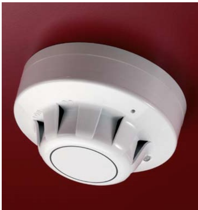
Optical Smoke Detector