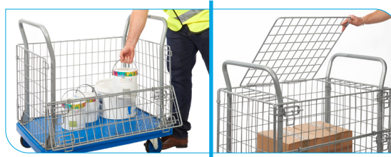
Hinged Lid Top on the PPU24Y & 1/2 Drop Side on the PPU23Y & PPU24Y