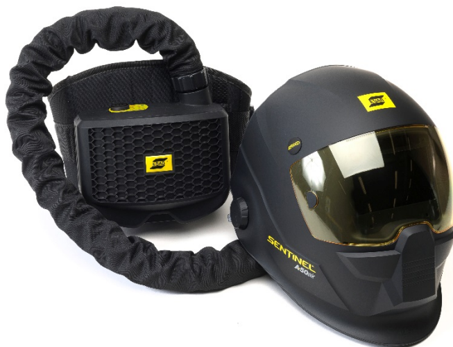
SENTINEL A50 Air with ESAB PAPR unit