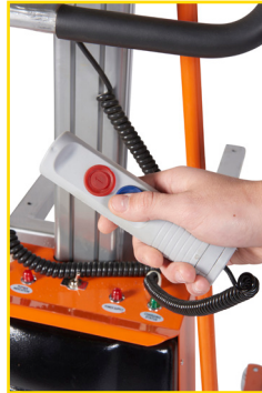
Remote Control for the MLE03Y