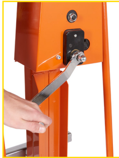
Winch System for the MLM01Y

CE GS geprüfte Sicherheit Approved Safety